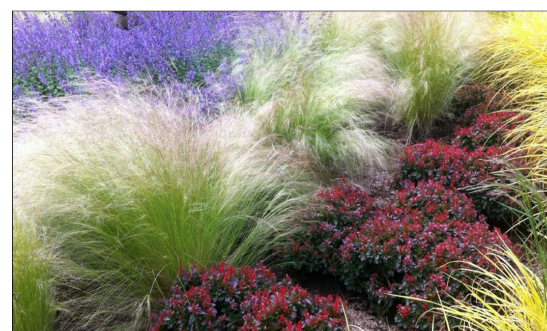
THE ASHES, INDICATIVE IMAGES

NOTE: - DRAWING ISSUED FOR PLANNING PURPOSE ONLY. LANDSCAPE IS SUBJECT TO APPROVAL OF THE PLANNING AUTHORITY